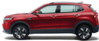
Cherry Red New