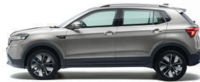
Steel Grey New