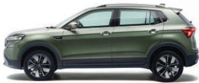
Shimla Green New