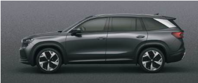
Graphite Grey metallic