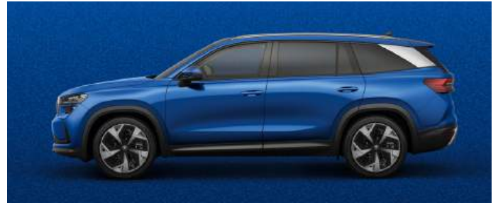
Race Blue metallic