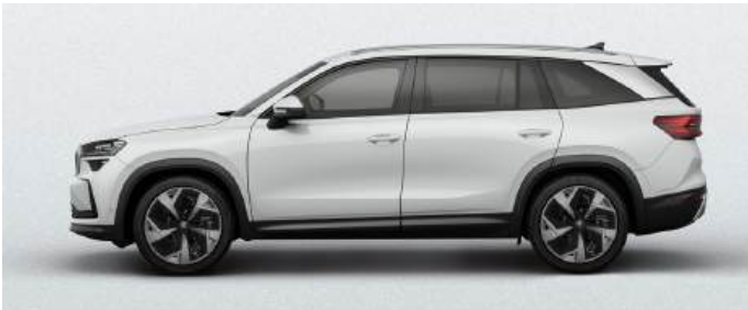
Moon White metallic