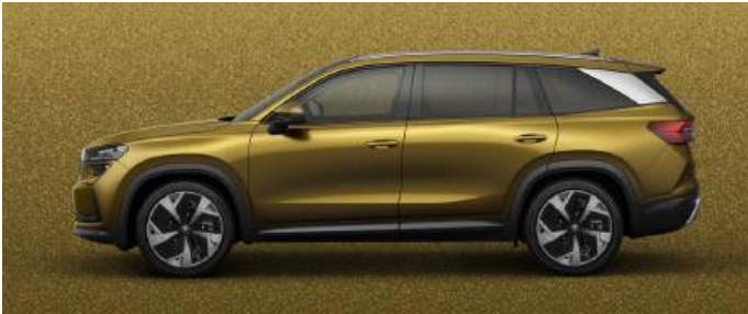
Bronx Gold metallic*