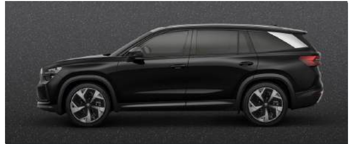
Magic Black metallic