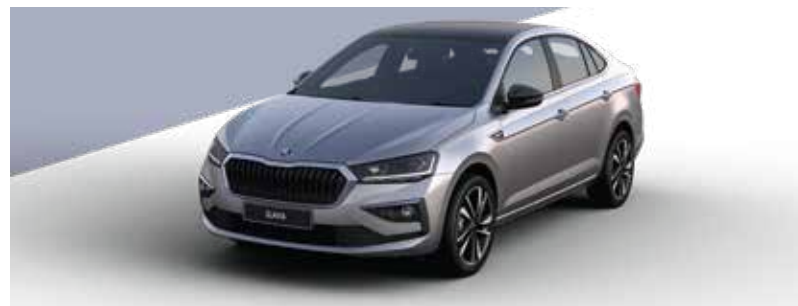
Brilliant Silver With Carbon Steel Roof