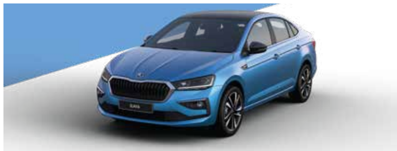
Crystal Blue With Carbon Steel Roof