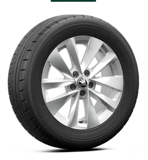
Silver Alloy Wheel R(16), SARGAS