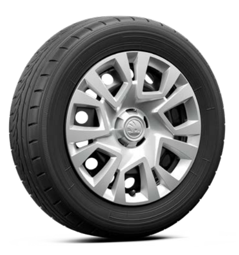
Steel Wheel R(16) with full cover, CARPO