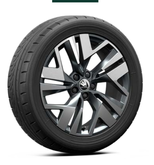
Dual Tone Alloy Wheel R(17), BENNY