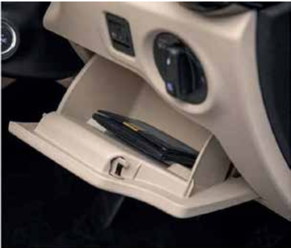
Driver Storage Compartment

Never compromise on boot space. Škoda Slavia sets the standard with best-in-segment storage – 521 liters with rear seats up, and a whopping 1050 liters when folded down.