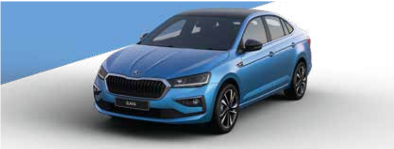
Crystal Blue With Carbon Steel Roof