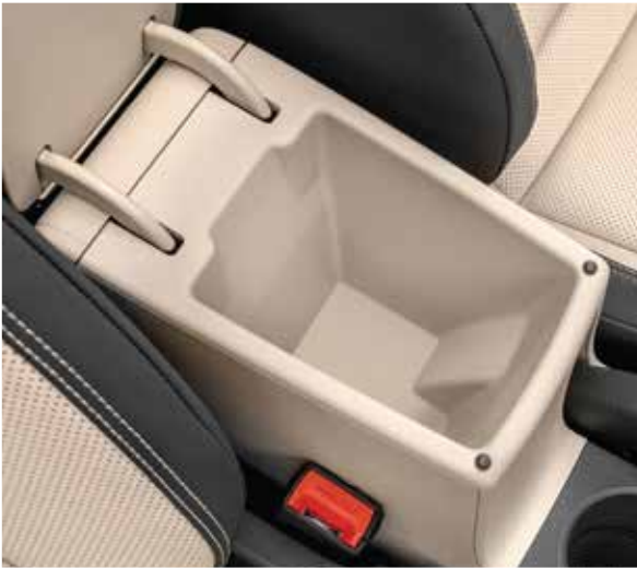
Storage In The Front Centre Armrest