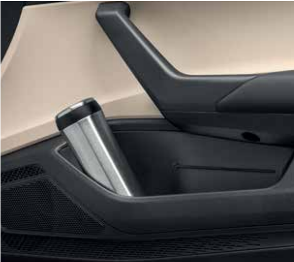
Storage In Front And Rear Doors