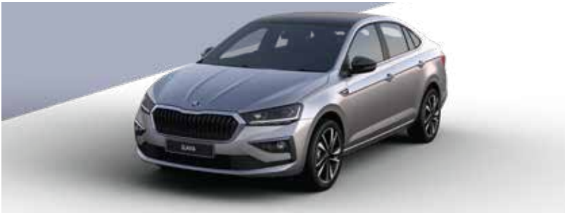
Brilliant Silver With Carbon Steel Roof