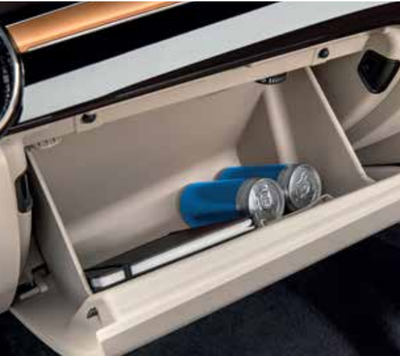
Cooled Glove Box