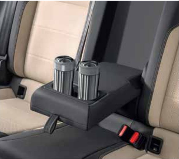
Cupholders In The Armrest