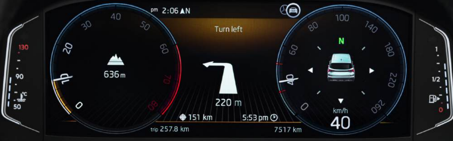
26.03 cm Virtual Cockpit with turn-by-turn navigation