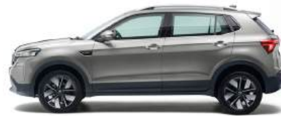
Steel Grey New