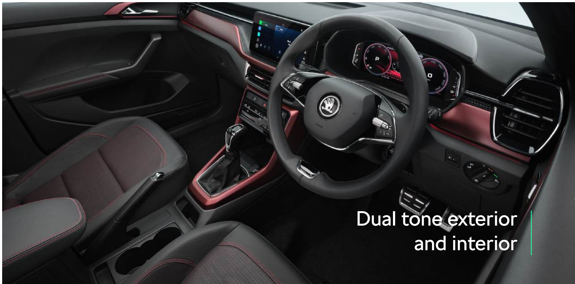
Dual tone exterior and interior