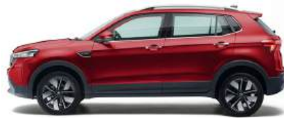
Cherry Red New