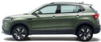
Shimla Green New