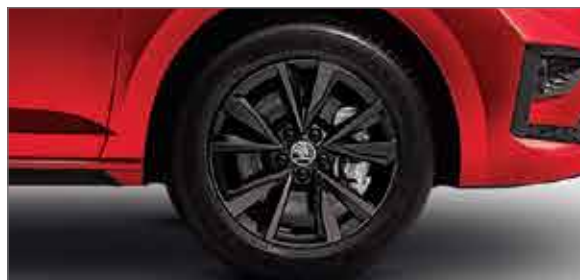
» R16 Black Alloy Wheels