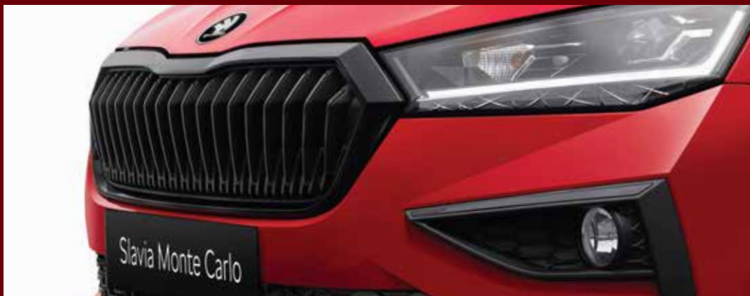
»» Black Škoda Signature Grill