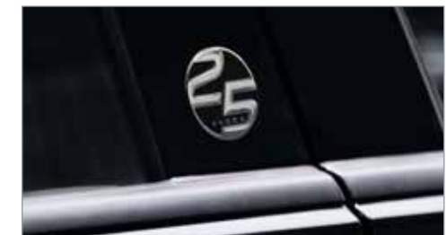
»» 25 Year Badge

Features and accessories shown here may not be part of standard equipment and is a part of dealer fitment, Actual product specifications may vary