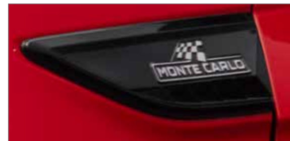
» Exclusive Monte Carlo Badging