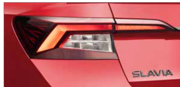
» Darkened Tail Lamps