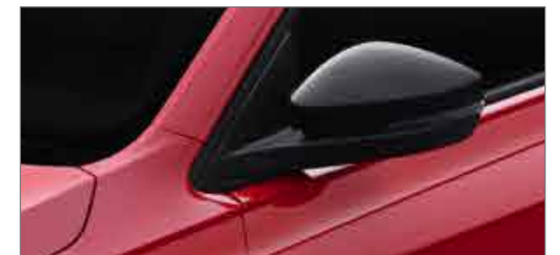
» Glossy Black ORVMs