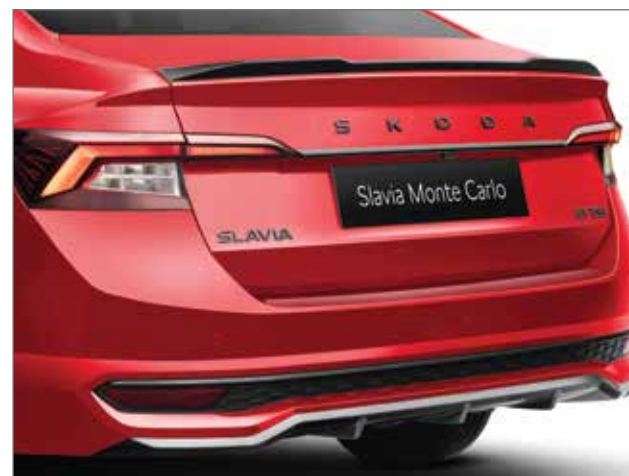
»» Sporty Black Exterior Package