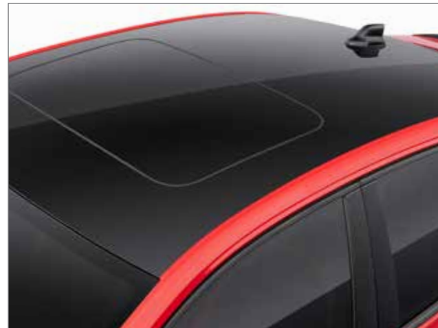
»» Dual Tone Electric Sunroof