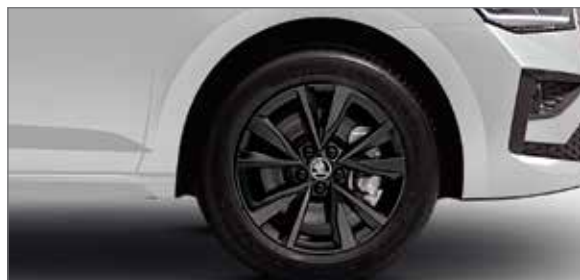
» R16 Black Alloy Wheels