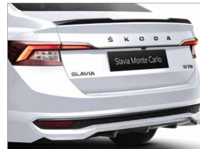
»» Sporty Black Exterior Package