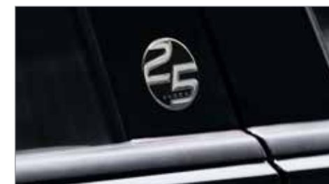
»» 25 Year Badge

Features and accessories shown here may not be part of standard equipment and is a part of dealer fitment, Actual product specifications may vary