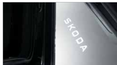
»» Puddle Lamp