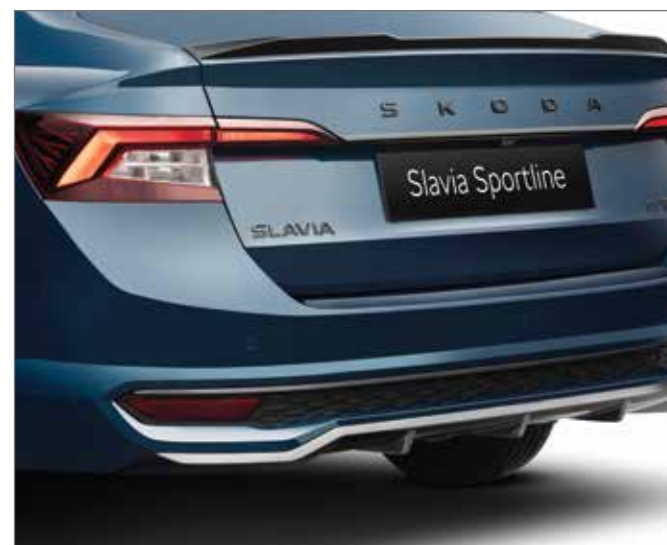
»» Sporty Black Exterior Package