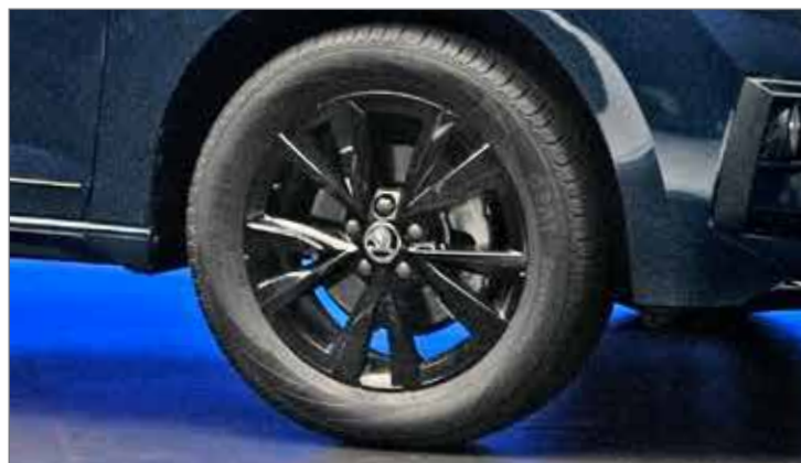
» R16 Black Alloy Wheels