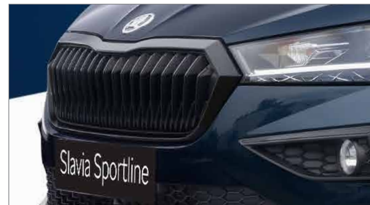
» Black Škoda Signature Grill