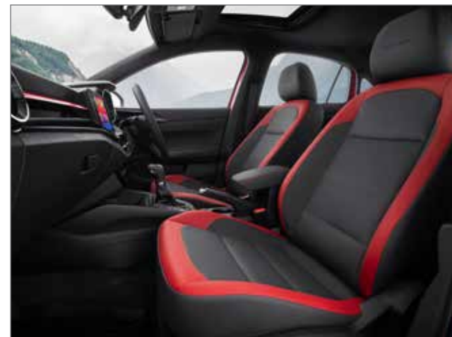
»» Monte Carlo Inscribed Ventilated Front Leatherette Seats