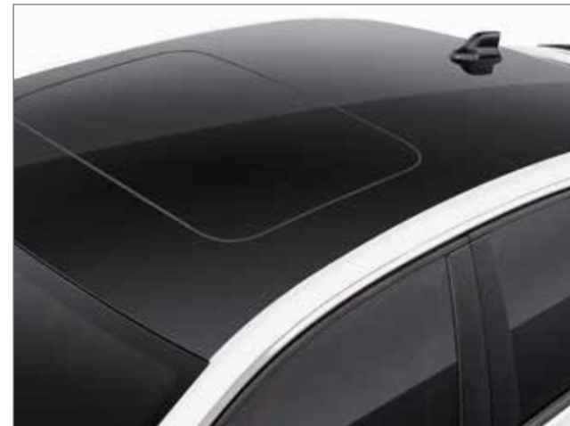
»» Dual Tone Electric Sunroof