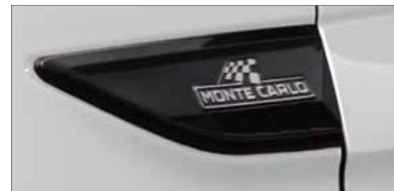
» Exclusive Monte Carlo Badging