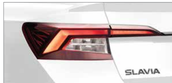
» Darkened Tail Lamps