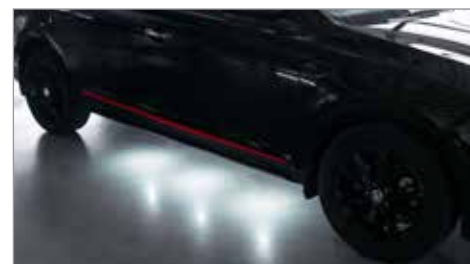
»» Underbody Lights