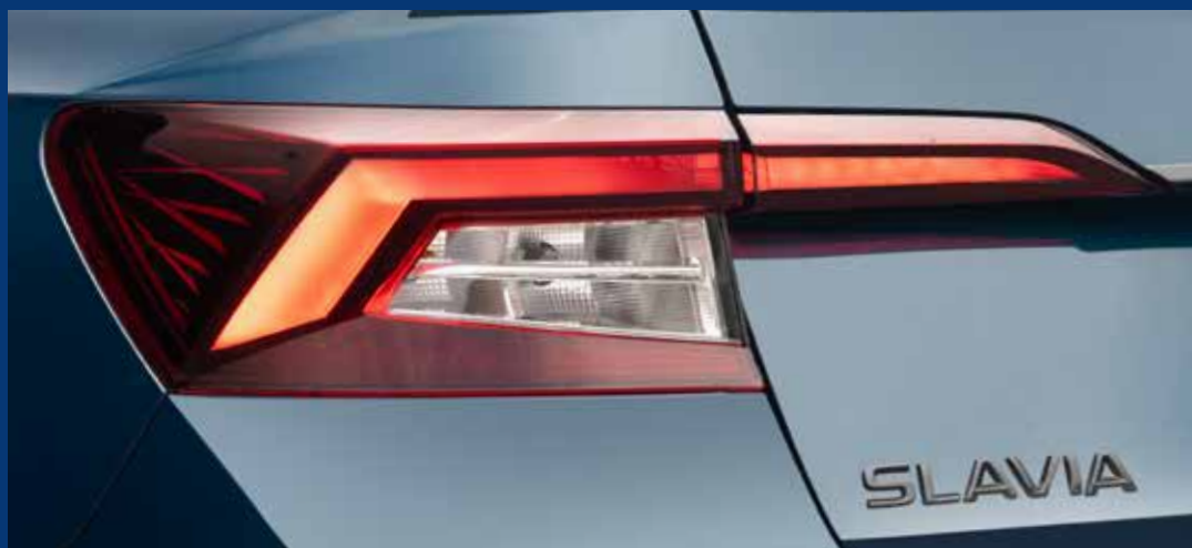
»» Darkened Tail Lamps