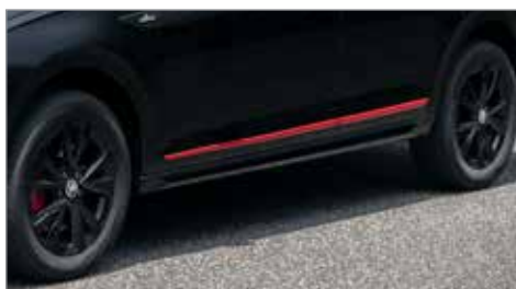
»» Monte Carlo Body Kit