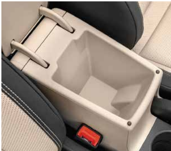
Storage In Front Centre Armrest