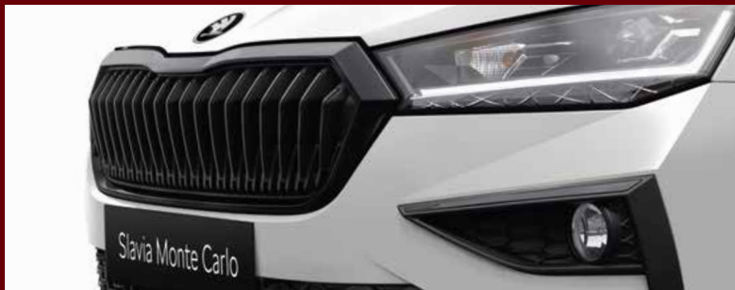
»» Black Škoda Signature Grill