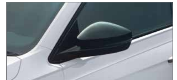
» Glossy Black ORVMs