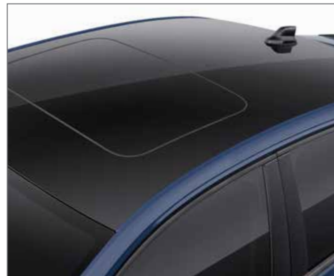
»» Dual Tone Roof with Electric Sunroof