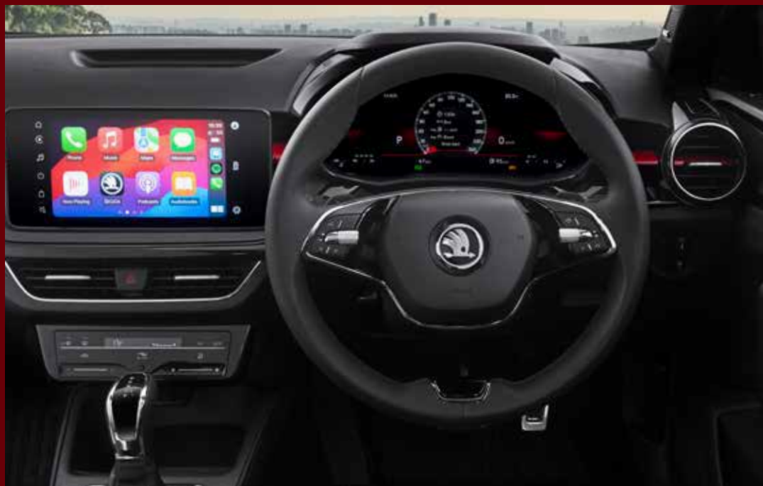
»» 20.32cm Škoda Virtual Cockpit with Red Theme