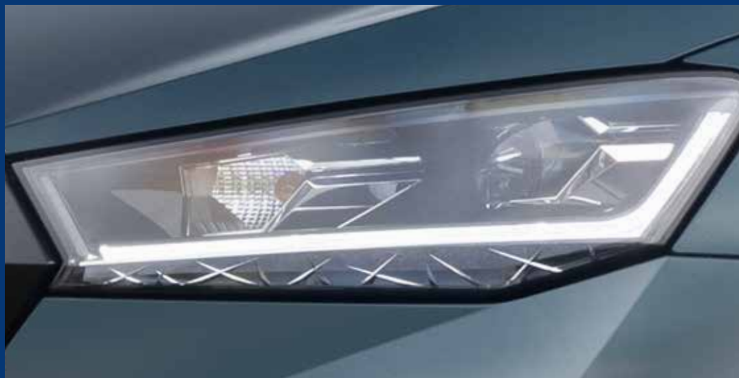
»» LED Headlamps with DRLs