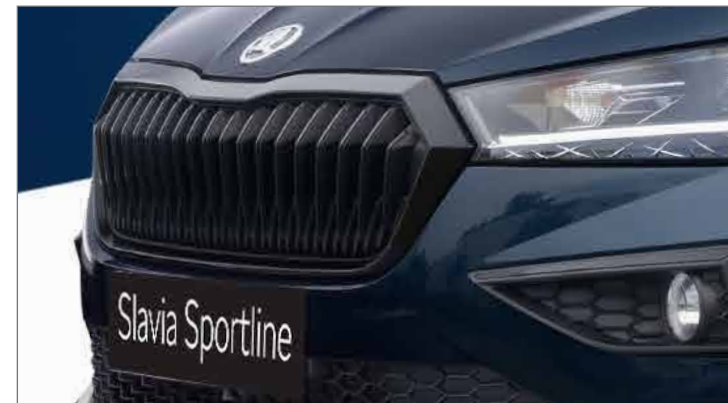
» Black Škoda Signature Grill